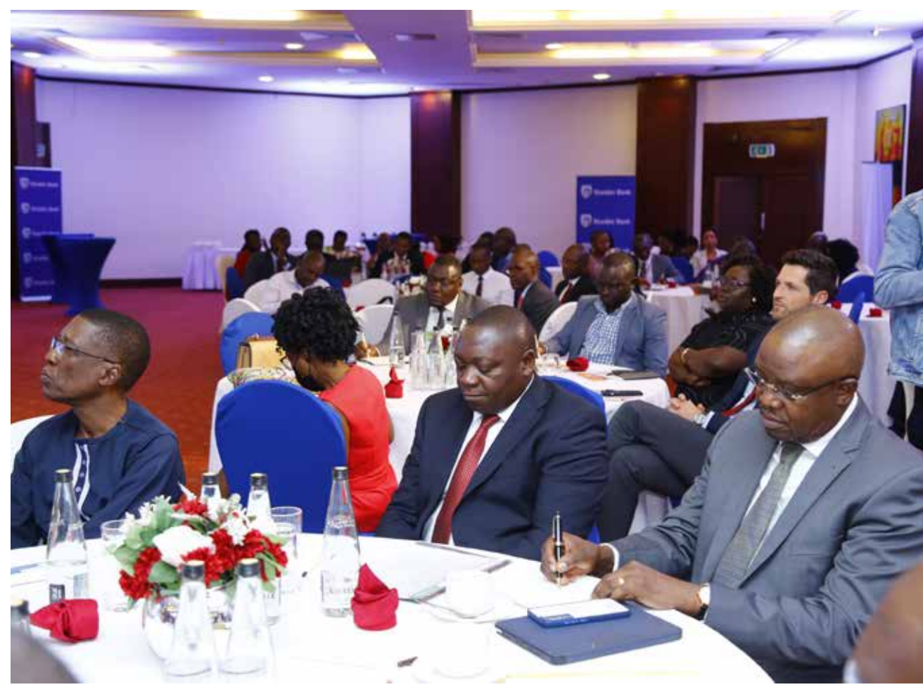
Participants at MoFPED-NTV Uganda Economic Summit

Rising public debt, unpredictable weather patterns as well as regional and global geopolitical tensions are some of the other possible risks highlighted.