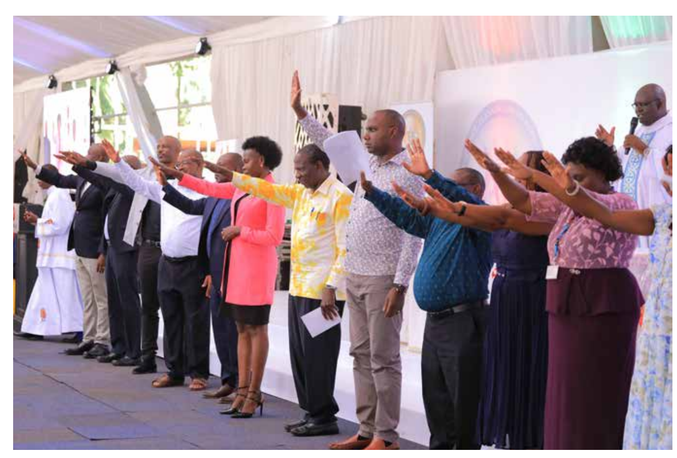
Ministry top leadership praising God