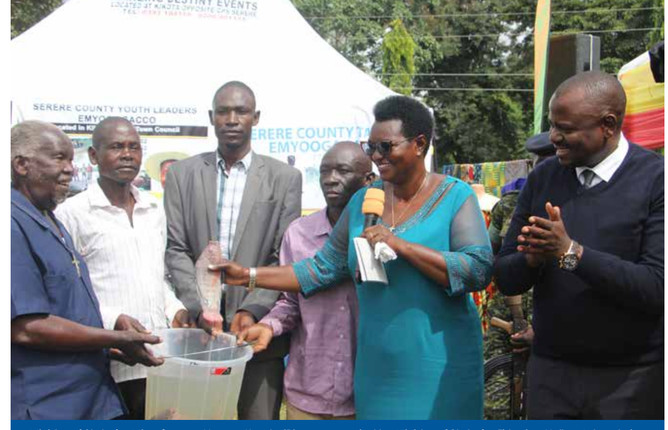
Minister of State for Microfinance Haruna Kasolo (R) accompanied by Minister of State for Fisheries, Hellen Adoa during the monitoring of Emyooga & PDM in Serere district recently