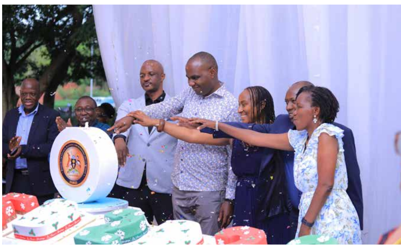
Cutting of the cake at the staff party