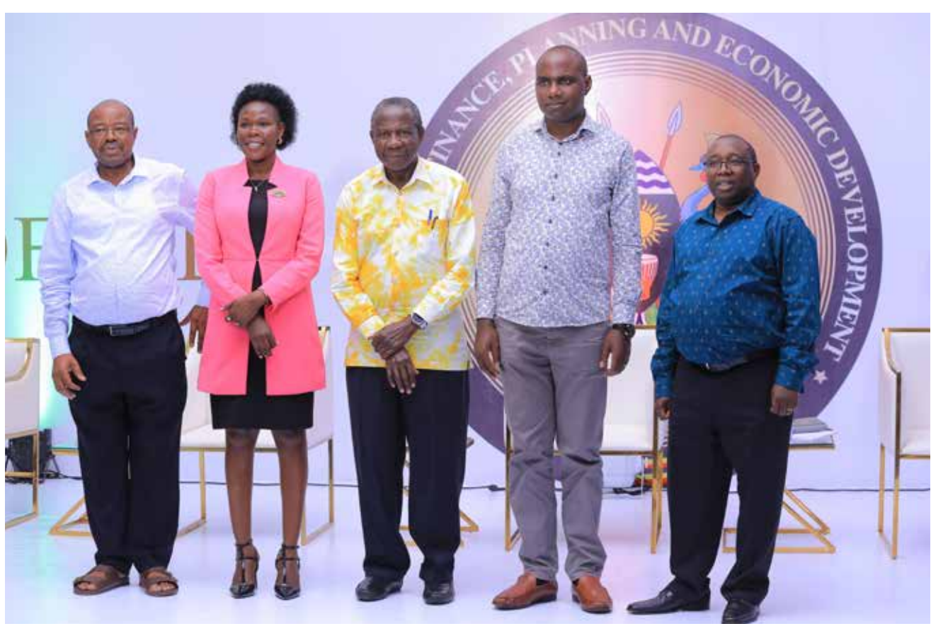
Ministers and the Accountant General (R)