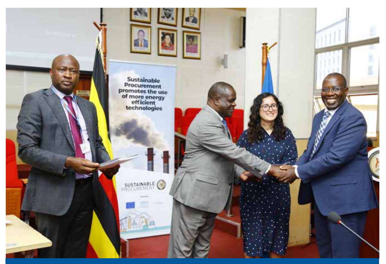
DST Ocailap (middle) handing over certificate to sustainable public procurement agent at MoFPED