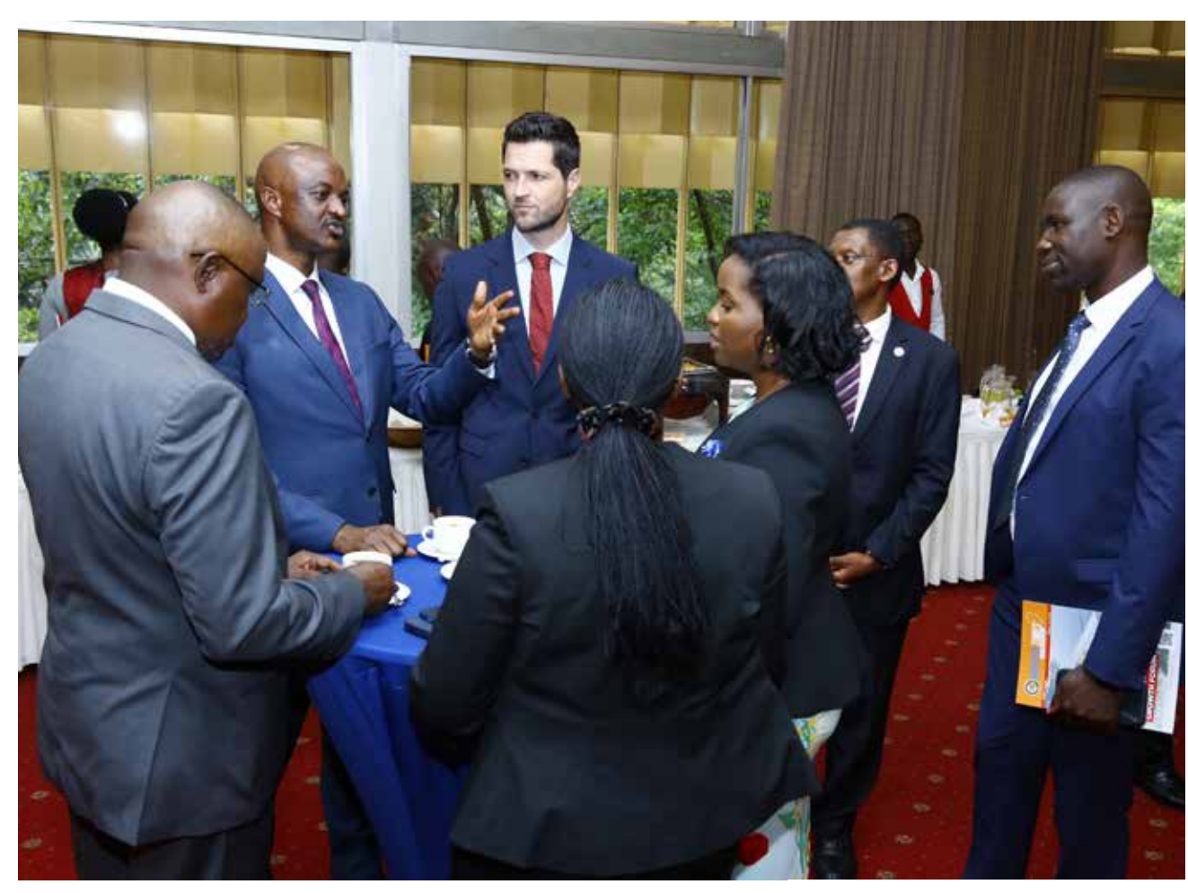
PSST shares a moment with guests at the MOFPED-NTV Economic Summit 2023

MOFPED-NTV ECONOMIC SUMMIT MOFPED-NTV ECONOMIC SUMMIT