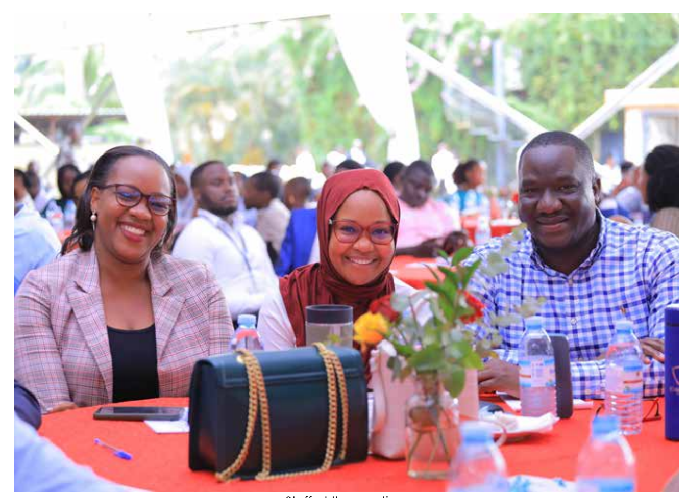
Staff at the meeting