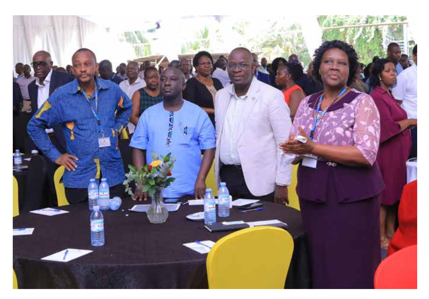
Top technical staff at the meeting

52 MOFPED TIMES | ISSUE 13 MOFPED TIMES | ISSUE 13 53