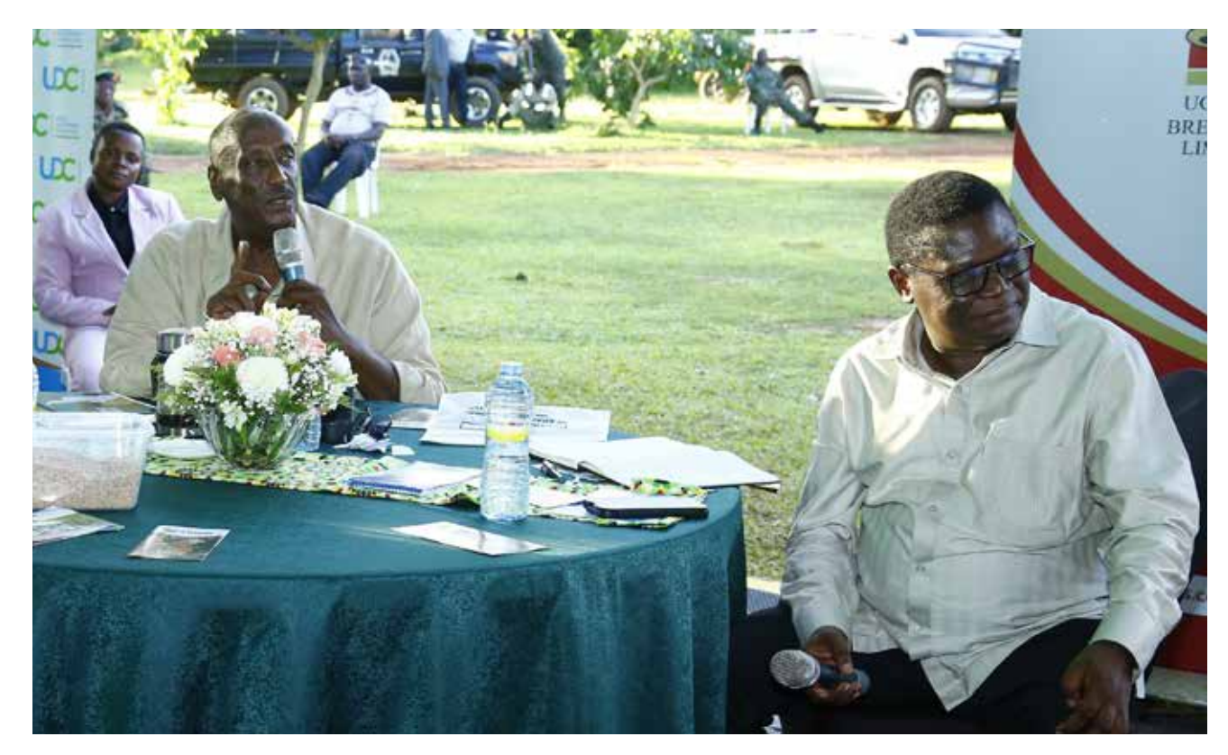
The Chairman of UDF Gen Salim Saleh (Rtd) flanked by Justice Minister Nobert Mao officiated at the conference