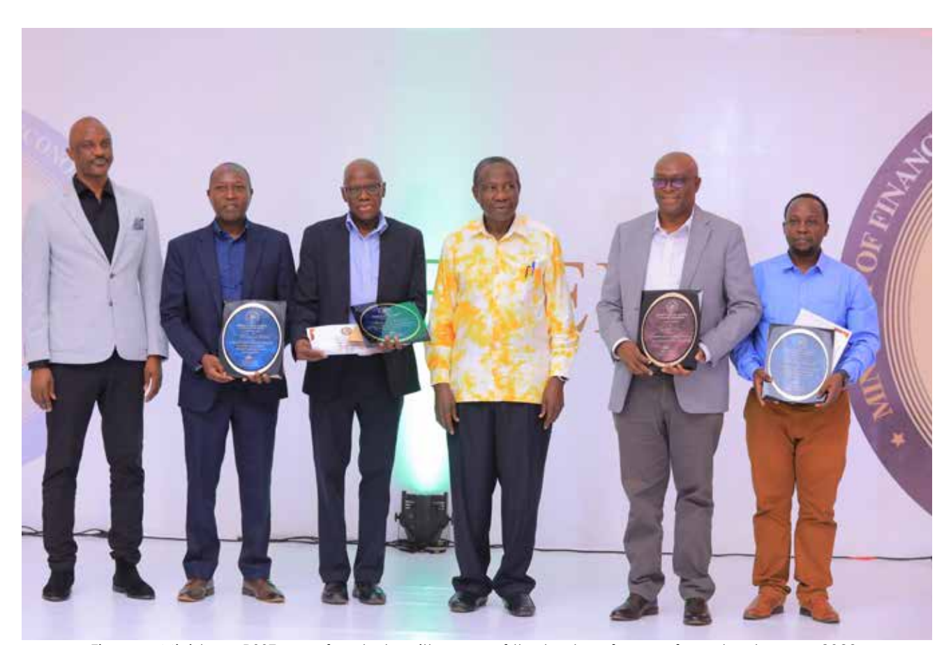
Finance Minister & PSST pose for photo with some of the best performers for calendar year 2023