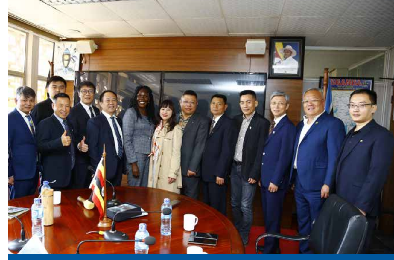
Minister of State for Investment & Privatization Hon.Anite (M) meeting the group of Chinese Investors ready to invest in Mbale Industrial Park