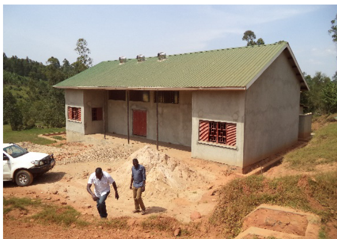
Uncompleted coffee huller shelter in Bushenyi district

The machines in Busia, Bugiri, Mayuge, and Kabarole districts had not been installed yet APF shelters were completed. Some installed APFs were non-functional despite the hefty investment.