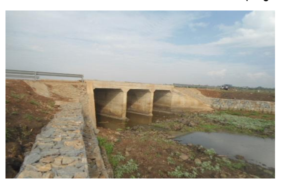
Leresi Bridge on Butaleja-Leresi-Budaka road completed

The construction of Leresi Bridge on Butaleja-Leresi-Budaka road was at 98% physical progress against a planned progress of 100%. Challenges like poor mobilization of contractors, delays in acquisition of the Right of Way (RoW) and relocation of utilities, and inadequate designs tendered for construction were however noted under this programme.