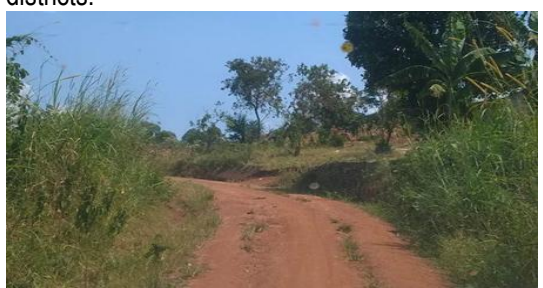
Part of Kijwiga-Kijugo Road with high vegetation cover on the road sides in Kyenjojo District

Under DUCAR, some of the road sections in the different districts monitored were not well maintained due to inadequate routine manual maintenance; these included Kyenjojo, Masaka, Buliisa and Nakaseke districts.