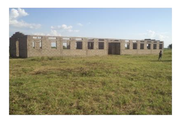
Incomplete girl's dormitory block at Lolachat Primary School in Lolachat sub county, Nakapiripirit district

hence rollover to a new FY. This was attributed to inadequate release of funds and lengthy bureaucratic processes in approval of paper work at OPM hindering timely and effective implementation of project activities. For FY2015/16, findings indicate that dormitories at Lolachat and Karita primary schools in Nakapiripirit and Amudat districts respectively were rolled over outputs from FY2014/15 to 2017. FY2016/17. Bv February the dormitories were incomplete as shown below.