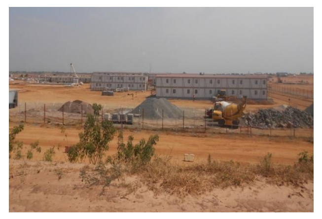
Ongoing construction works for the housing camps at the Tilenga Central Processing Facility

The development CPFs in Tilenga (Nwoya, Buliisa) and Kingfisher fields (Kikuube) showed good progress. The industrial site preparations for Tilenga CPF with a total of 31 well pads and 426 wells were at 57% against a planned progress of 68.5%. Works included the construction of base camps and the drilling of 6 out of the 7 planned wells. Works on the operations base were yet to start. On the other hand, the civil works for Kingfisher CPF development (4 well pads) were at 10% and activities on the worker's camps were ongoing.