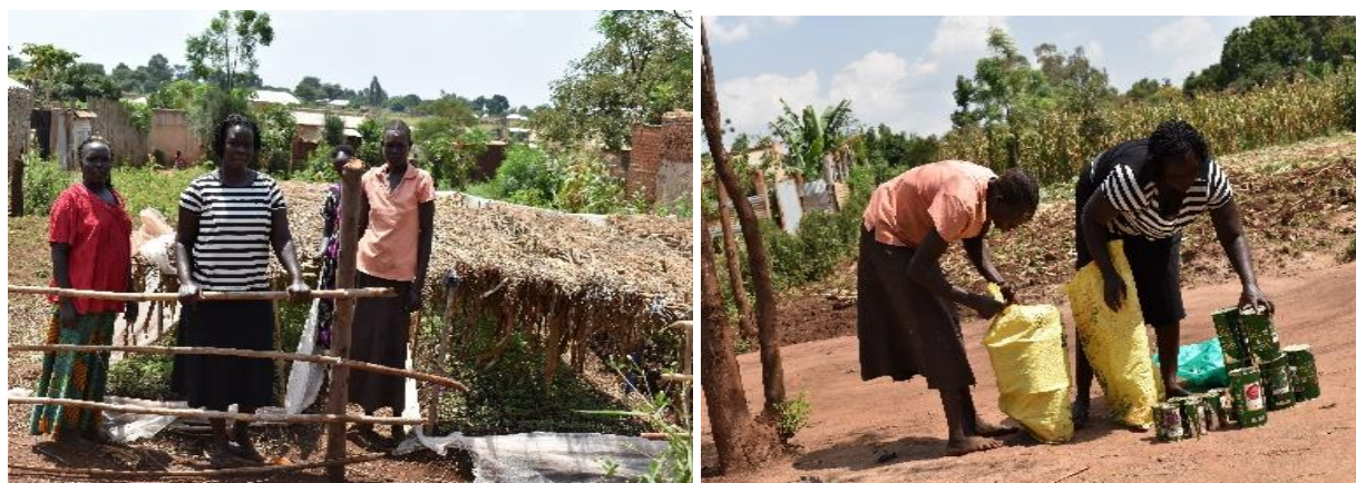
L-R: Members of JC Vegetable Growers-CIG at the tomato nursery bed; Procured seedlings in Panyadoli Settlement in Kiryandongo LG

Kiryandongo District Local Government: In the Panyadoli Refugee Settlement, capacity-building needs were identified by OPM, not the beneficiaries. Four groups were supported with Ug shs 18 million each. The trainings were implemented by technical officers at the districts and the implementation partners. The team visited JC Vegetable Growers engaged in tomato and onion growing. Members were trained in the establishment of nursery beds for tomatoes and onions, lining and putting ridges, staking, enterprise selection, and financial management. The group comprised 15 members (13 females and 2 males), of these three were PWDs, one elderly and five youth, and they received Ug shs 18 million for setting up the nursery beds, trainings, ploughing and purchase of seedlings. Members have used the profits shared to improve their livelihood in many ways, including starting personal businesses, improving the houses they live in, and paying school fees for their children, social cohesion was evident in most communities.