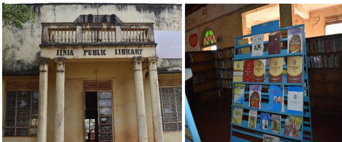
L-R: Exterior and interior views of the Jinja Public Library

Library users accessed library services offline and online: By 30 th June 2023, a total of 400,000 out of 423,108 users accessed the library services physically and online from 16 libraries for instance 1,567 for NLU; 2,012 for Soroti; 3,616 for Nyarushanje; 356 for Arua; 71,635 for Hoima; 6,138 for Kabarole; 31,464 for Mbale and 356 for Monica Memorial Resource Centre; 54 for Piadha; 559 for Bugiri; 700 for Masaka; 153 for Nebbi; 2,410 for Nakaseke Tele Centre; 1,076 for the Nambi Sepuuyya Community Resource Centre; 2,798 for Pallisa however, usage of statistics from other libraries was not yet readily available.