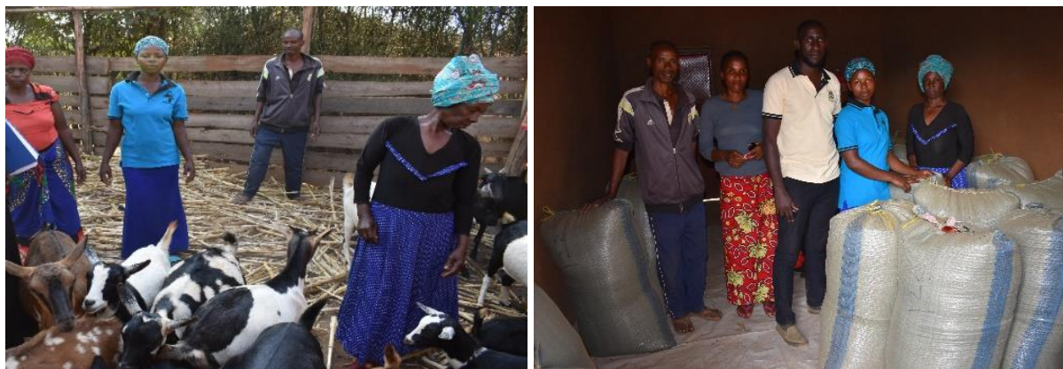
L-R: Members of Ngarama-A Produce Traders CIG (Produce Trading) with goats they procured; and with their produce stored at Nakivaale Refugee settlement, Isingiro District LG

In the Nakivale Refugee Settlement, in Isingiro District Local Government, members of Ngarama A Produce Traders CIG (Produce Trading) were engaged in produce and goat rearing. They were trained in procurement processes, record keeping and financial management to enhance their skills in managing finances. The group comprised of 15 members (8 females and 7 males) received Ug shs 18 million for produce buying where they utilized 5 million and procured 34 goats for rearing. They reaped a profit of Ug shs 1.5m which was to be saved.