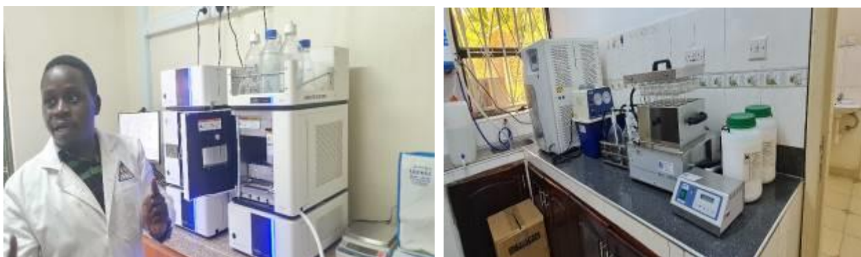
Left: A liquid chromatography in the chemistry lab at Lira UNBS Regional Laboratory. Right: Some of the equipment at Mbarara UNBS Regional Laboratory

regions as well as generate non-tax revenue. The laboratories were functional but had limited space for working and installation of some of the equipment.