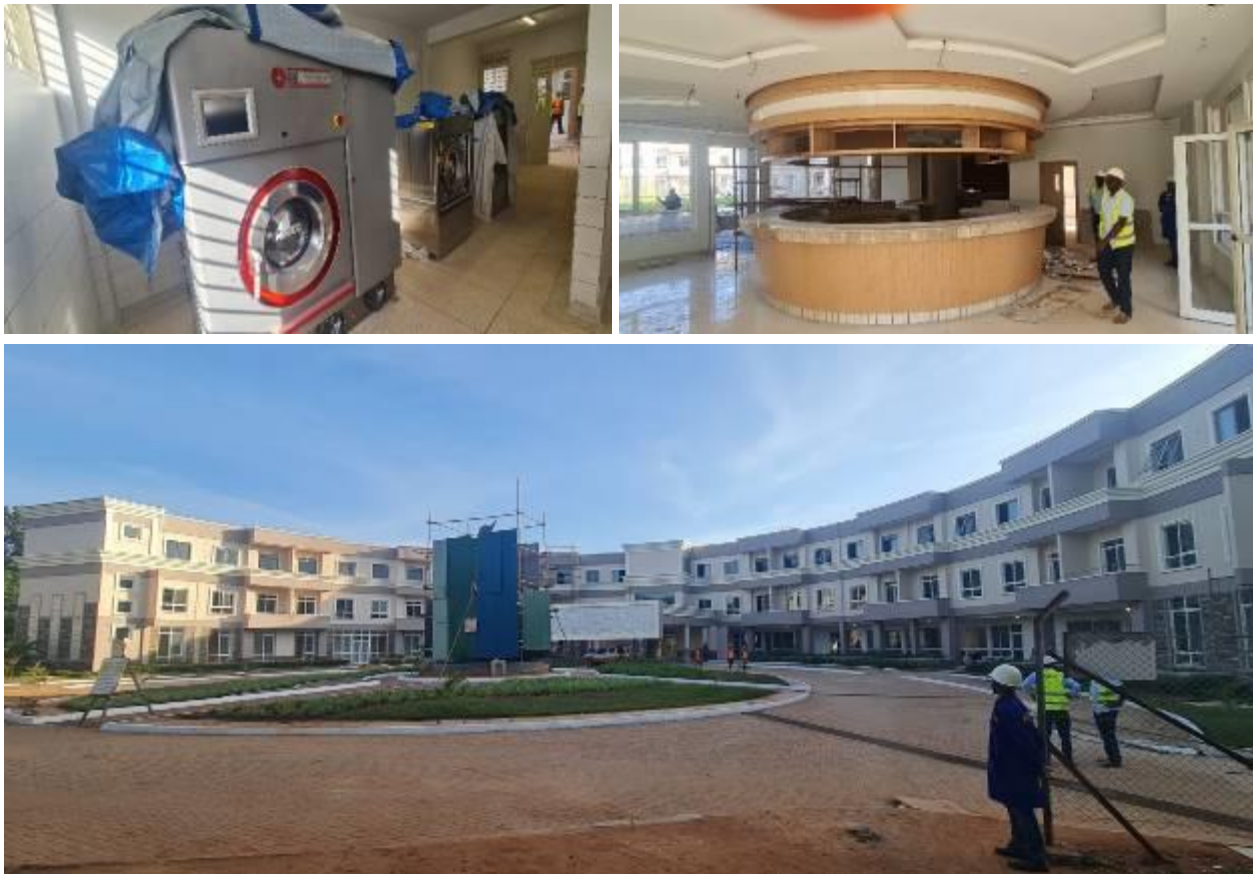
Top left: Some of the laundry equipment procured for the Uganda Hotel and Tourism Training Institute (UHTTI). Top right: Renovation works at the reception area of the UHTTI. Bottom: Front view of the UHTTI under renovation in Jinja District

The Uganda Hotel and Tourism Training Institute (UHTTI) completed and operational: The construction works for the additional 30-room floor at the UHTTI was awarded to ROKO Construction Limited and civil works were estimated at 68% by 30 th June 2023. Pending works included final finishes on the compound, tiling, final painting, plumbing and electrical works. Assorted laundry equipment was delivered and installed at the hotel and the contract for the supply and delivery of kitchen and bar equipment was signed. The designs for the UHTTI phase II construction works were updated and the evaluation of bids was ongoing.