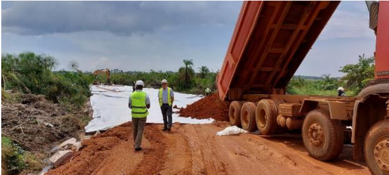
Ongoing works in South C estate at KIBP

There was a compromise on the quality of works arising from the contractor's refusal to have materials on site as agreed in the contract and violation of the approved designs. For example, 900mm diameter culverts are to be fully encased with concrete however, some 900mm culverts had been encased to half-width. This compromises the quality of drainage works and durability.