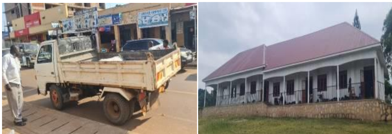
Left: A tipper truck procured by Awach Hardware, an SBRF beneficiary in Gulu City. Right: A four classroom block constructed at Blessed Victors Secondary School in Buwalula Village, Mityana District using part of the SBRF

“I was able to buy a second-hand tipper truck which has eased the delivery of goods to my customers outside the city,” said one of the SBSRF beneficiary-Awach Hardware in Gulu City, Pece-Laro Division.