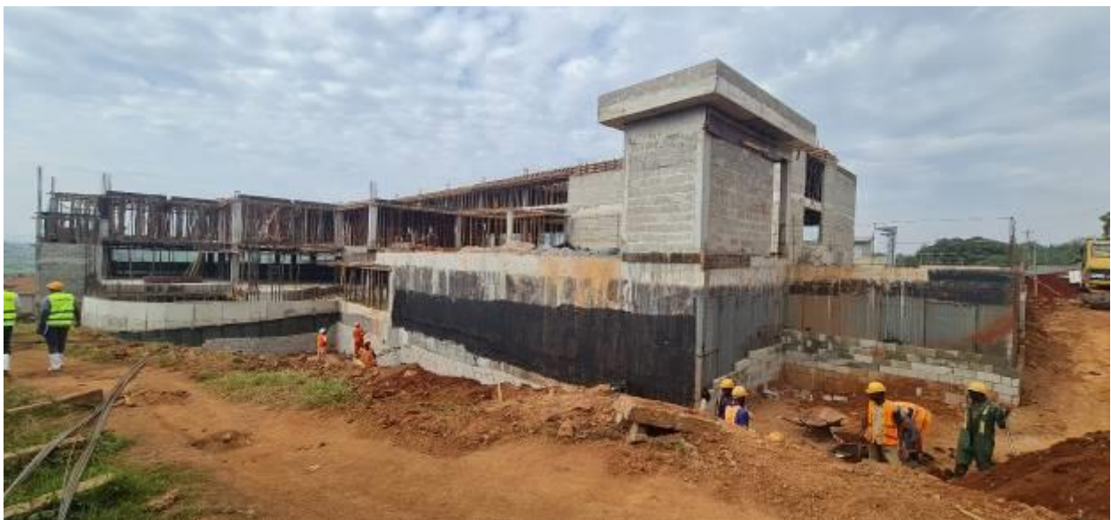
Ongoing construction at the National Business Development Centre at Butabika, Nakawa Division, in Kampala District

The National BDS Centre in Butabika constructed: The construction of the National BDS Centre by M/s Reliable Engineering and Décor Limited and Sheeba Construction (JV) was ongoing at Butabika in Nakawa Division. The scope of works includes: the construction of an ultra-modern office (seven-storey high with three floors of basement parking, and four floors of main tower covering 13,400 square meters); and external works including paved distributor and access roads, and parking. The contract start date was 20 th June 2022 whereas the end date is 20 th February 2024.