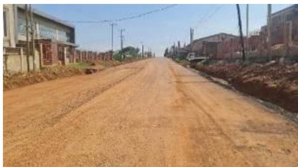
L-R: Stone pitching along a road in the North Estate. A levelled A2 road ready for paving in South A Estate of the Kampala Industrial and Business Park