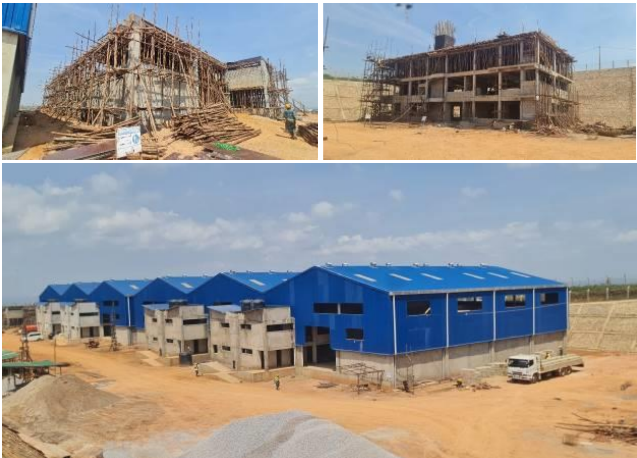
Top left: production unit 4 under construction. Top right: One Stop Center (trade house) at Entebbe under construction. Bottom: Substantially completed production units 1, 2 and 3 at the Entebbe International Airport Free Zone

Construction works at the Entebbe International Airport Free Zone attained an annual progress of 22% in FY2022/23. The overall project progress was at 63% against the planned 69%, with an overall revised time progress of 69%. The progress of works was as follows: production units I and II, earthworks, retaining walls, road works to formation level, and southern embankment wall geo-nailing works were completed. The trade house and anchor unit block work alongside external works were ongoing and estimated at 22%. Due to inadequate funds, the completion date was revised from 4 th December 2022 to 5 th October 2024. The construction works for accommodation facilities at Buwaya for the security personnel were completed, and the UFZA effectively occupied the Land.