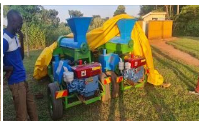
Left: A truck procured for Rwenzori Farmers' Cooperative Union in Kasese Municipality. Right: Maize sheller acquired by Aber-Kamdin Grains Area Cooperative Enterprise Limited